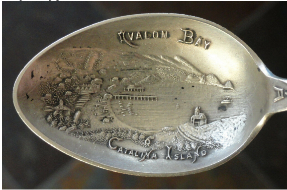
Mayer Type 3

Diagnostic feature: a distinctive serif on the first "A" in Avalon and on both staffs of the "N"s in "Catalina Island". The scene shows a relatively complex Sugarloaf Point configuration, and the post 1902 dormered roofline of the Hotel Metropole.